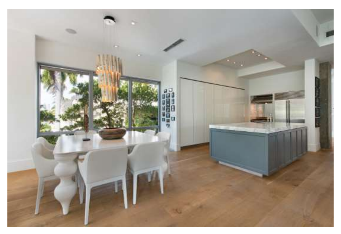
The three-bedroom residence even includes a rooftop deck.