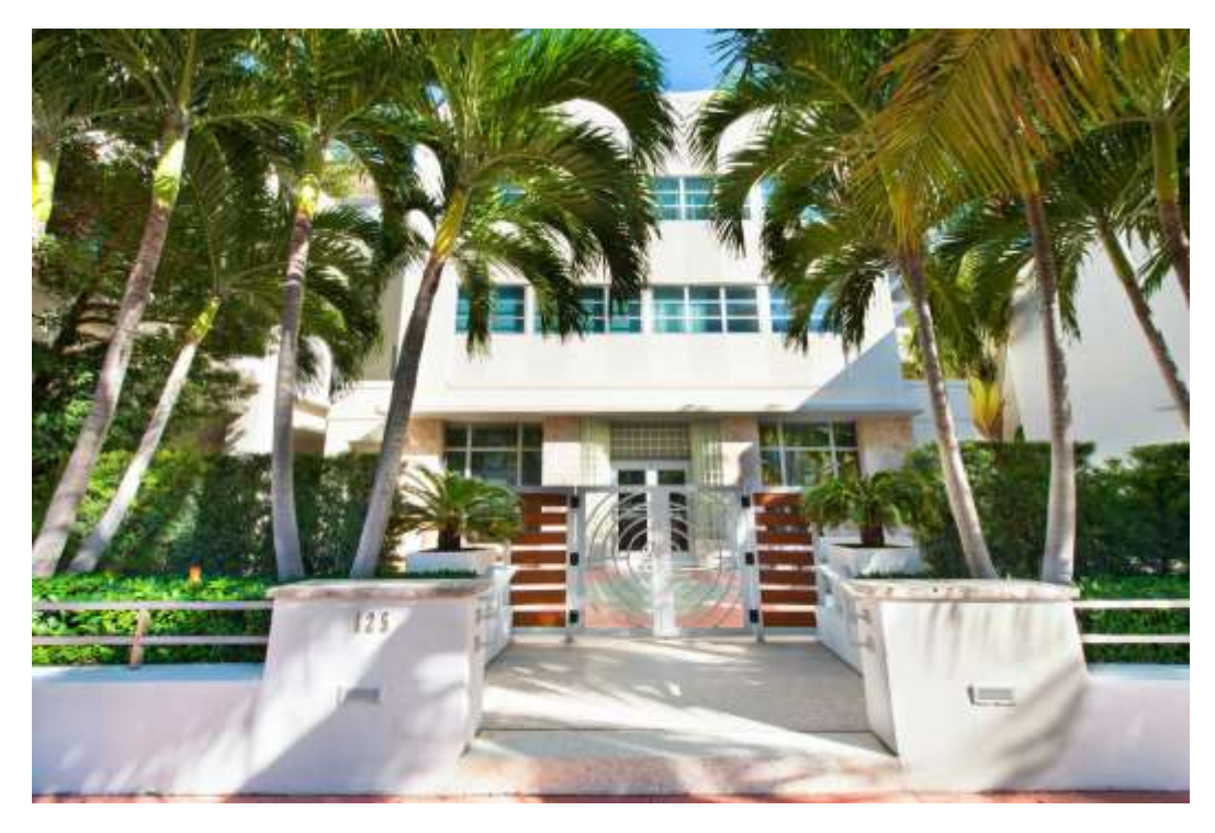
The completely renovated residence is located in the heart of Miami's coveted South of Fifth neighborhood, mere steps from the ocean and all of the great locales that make SoFi the hottest neighborhood on the beach.