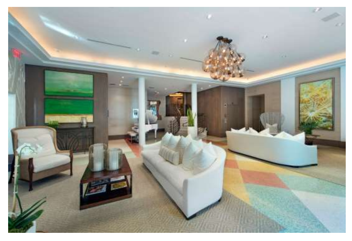
Countless luxury touches include oak and marble flooring, exceptional millwork and custom built-ins, a sleek Italian chef's kitchen, and gorgeous plantation shutters throughout.